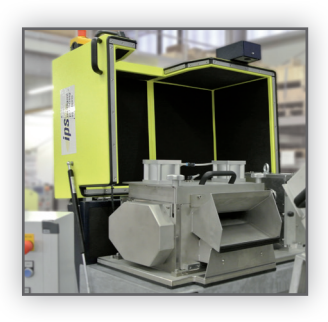
Easy access to the cutting head for cleaning or maintenance work