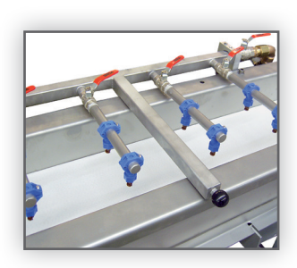
Easy-to-replace process water spray nozzles