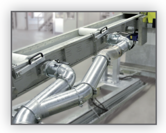
Integrated strand dewatering through the strand conveyor belt