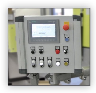
Central control panel