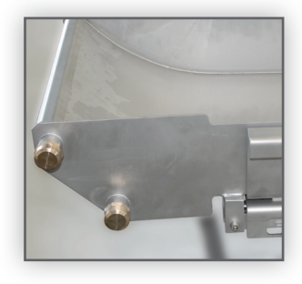
Sophisticated details – round start-up head to prevent the deposit of polymer strands