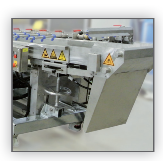
Particularly simple and ergonomic operation.

Height adjustment of the start-up head for adaptation to the process conditions