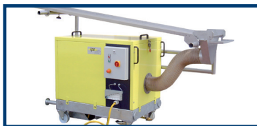
Option: Special suction box combined with strand guide