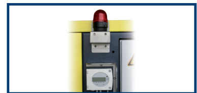
Option: Differential pressure measurement to display the filter change status

We reserve the right to make changes without notice. The illustrations may include options and accessories that are not part of the standard scope of supply.