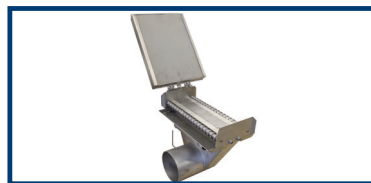
Option: Additional sound insulation to the suction box